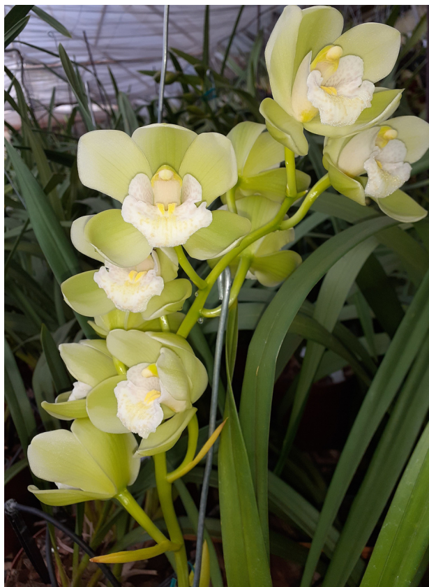
Cym. Neutron Star 'Peppermint Cream'