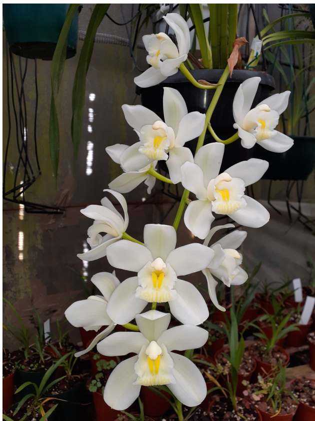
Cym. Neutron Star 'Mothers Day'

Cymbidium Neutron Star is a hybrid we made in 2018, the seed was germinated at King plants and deflasked at Orchidology 2019 and 4 years later we have some flowers.