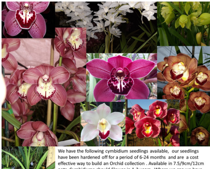
We have the following cymbidium seedlings available, our seedlings have been hardened off for a period of 6-24 months and are a cost effective way to build an Orchid collection. Available in 7.5/9cm/12cm pots. Cymbidium should flower in 1-2 years. When you purchase from