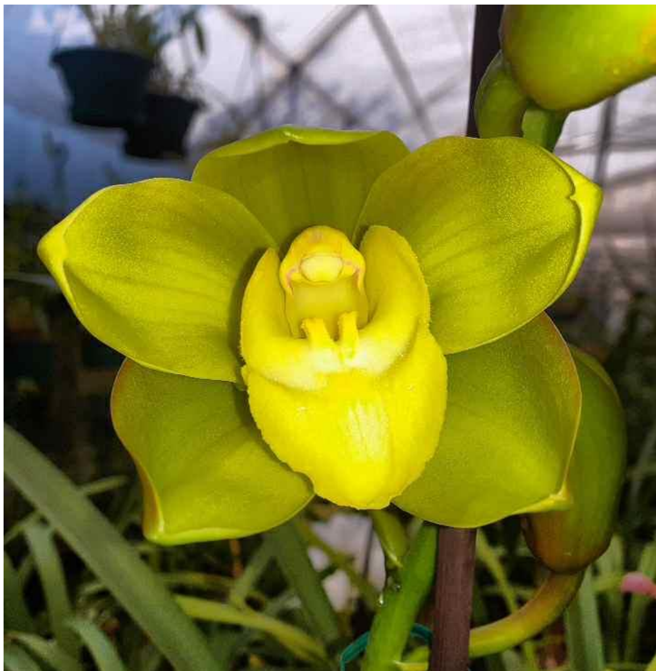
OS1817. Cym. Falling Passion x Beau Guest Passion Beau Guest is a large standard with a concolour lip, lemon colour ,Falling Passion is an alba white . Progeny will be intermediate/standard types, white, yellows and greens, since both parents carry the alba traits many of the progeny should be albas. Should be a great cut flower or pot plant 3 year old,15cm pot , R175