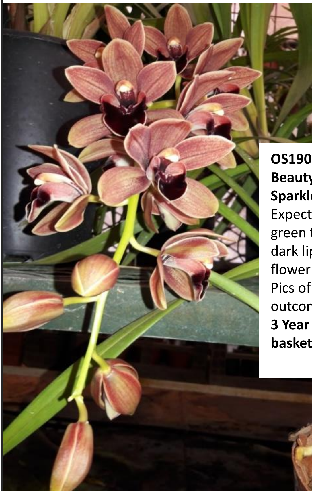
OS1903 Cym. Sapa Beauty x Pacific Sparkle

Expecting pendulous green to browns with dark lips, with high flower counts. Pics of expected outcomes 3 Year old ,15cm basket , R200