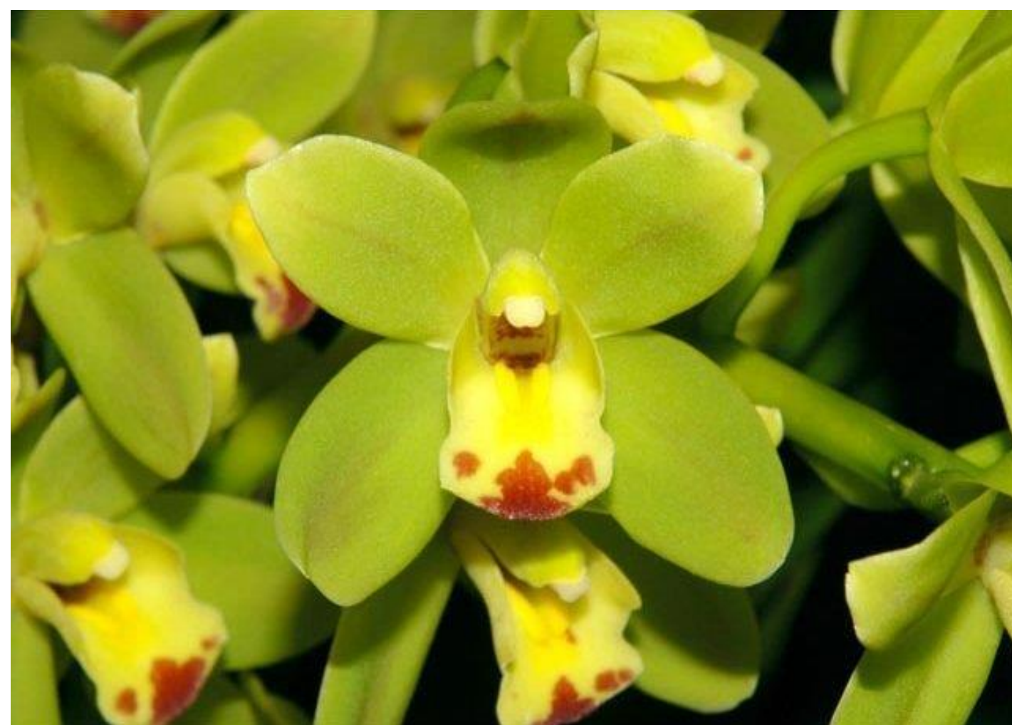
OS1902 Cym. Sapa Beauty x Beau Guest 'Glen' 3 year old, Sapa Beauty is a lemon green pendulous with a sparkling red lip , flower count of 30+ blooms per inflorescence ,crossed with a standard con-colour green. We are hoping for arching greens with some red spotting on the lip and some con colours 15cm pot , R175

Both parents are pendulous one a concolour. Pendulous progeny expected , yellows through to green with some concolour lips 15cm Hanging basket R175