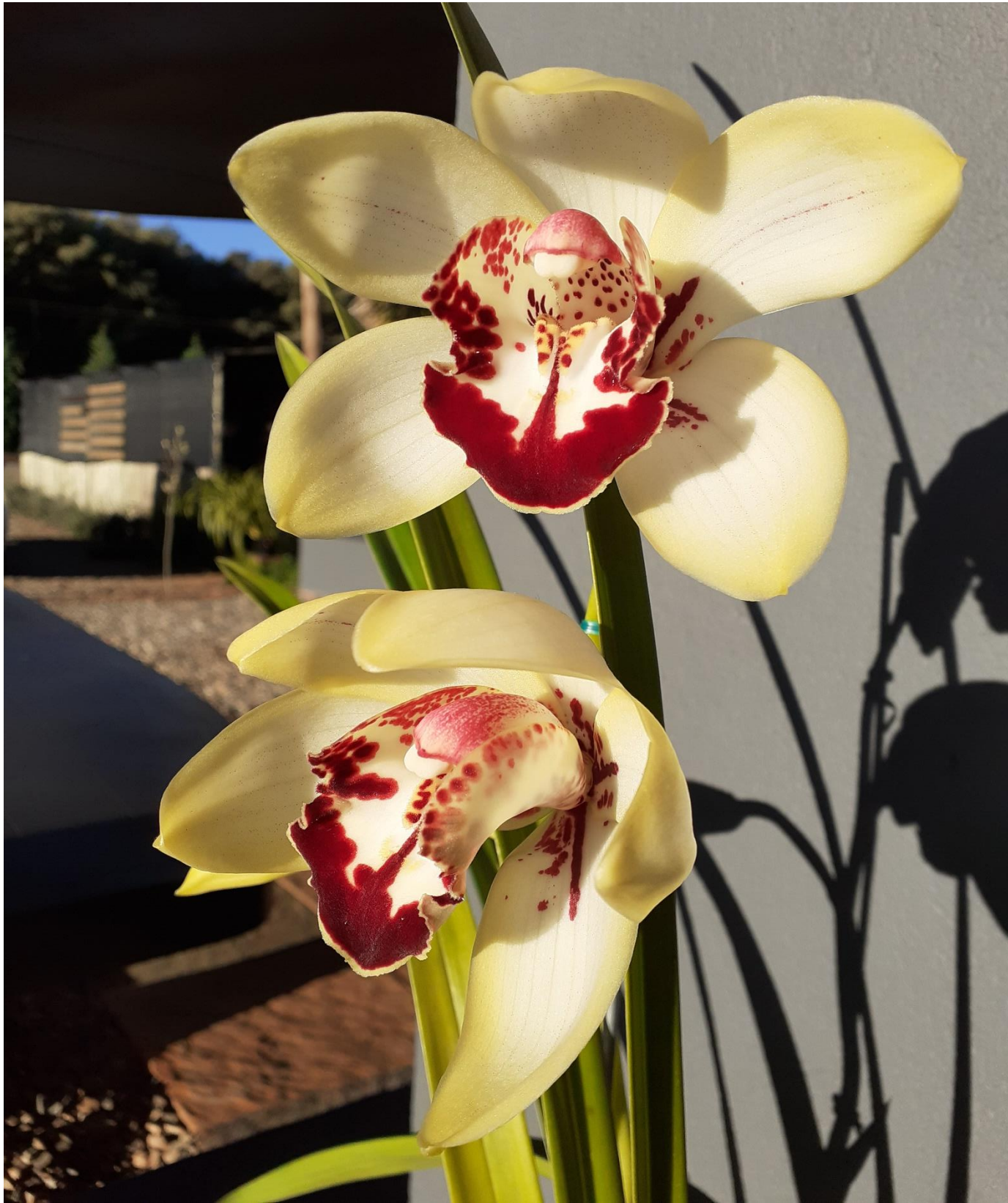
OS1809 Cym. Maria Maria Conceição de Freitas 3 year old ,15cm pot , R150