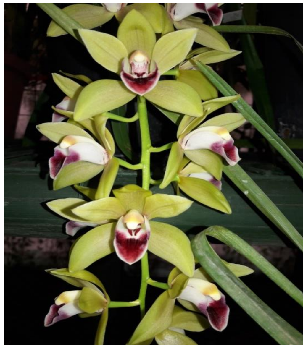
OS1904 Cym. Sapa Beauty x Emeralds & Rubies

Expecting pendulous green to browns with dark lips, with high flower counts. Pics of expected outcomes 3 Year old ,15cm basket , R200