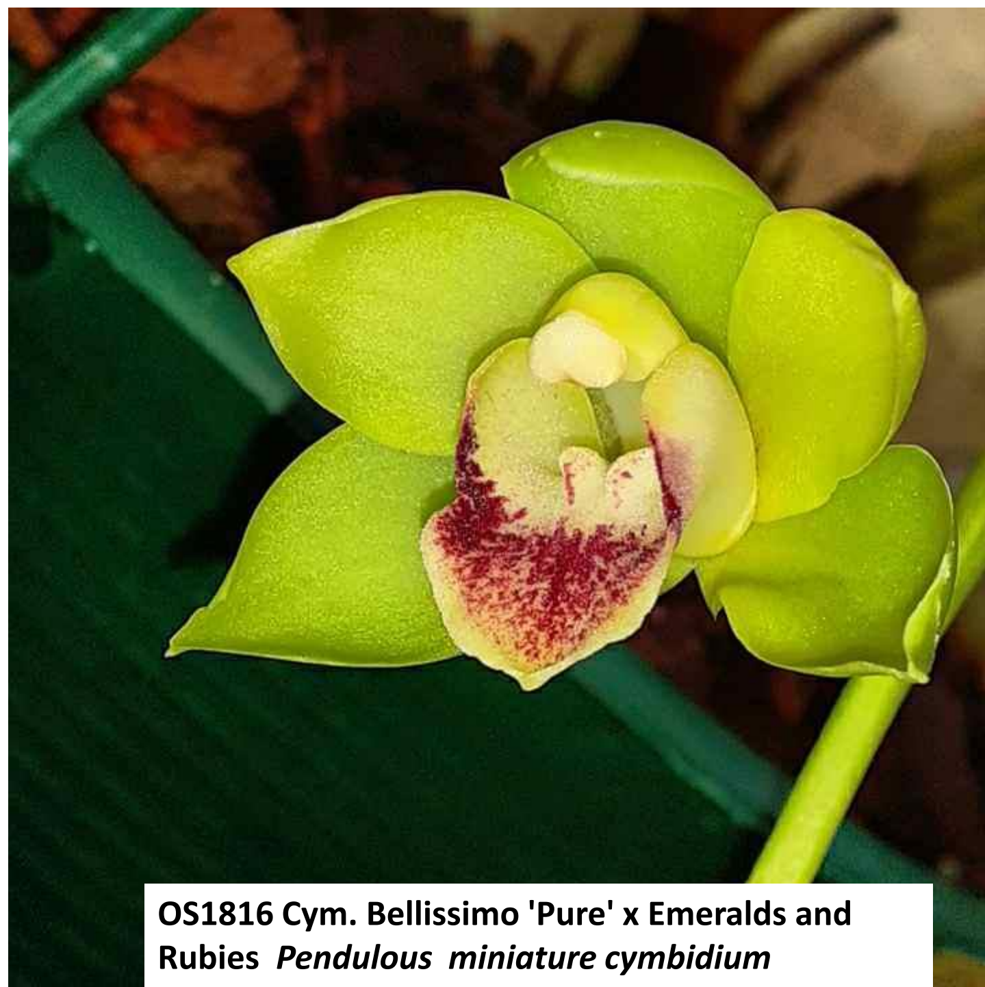
OS1816 Cym. Bellissimo 'Pure' x Emeralds and Rubies Pendulous miniature cymbidium

Grow potted in bark chips and peat medium