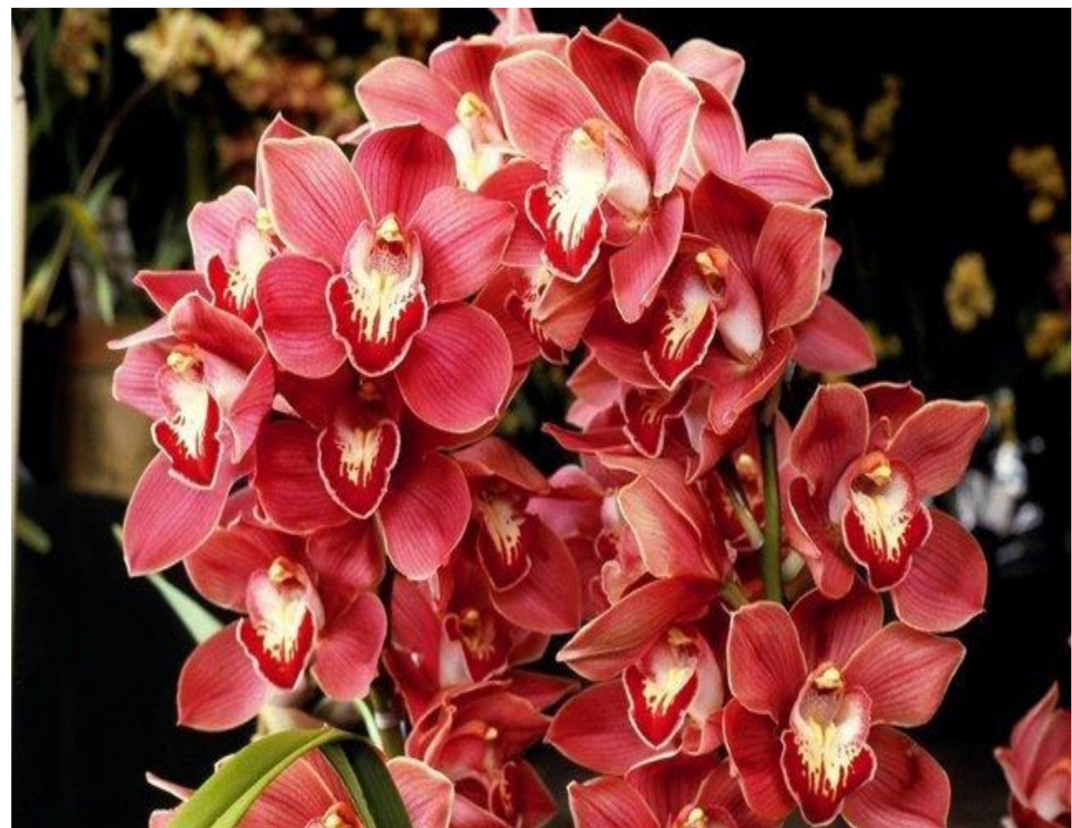
OS1823. Cym. Kalahari Sunset x Darch Freak ' Dusty sunset brown , large long stems of 20 + , Progeny should be browns , orange through to pinks with some pelorics inbetween. 3 year old,15cm pot , R150